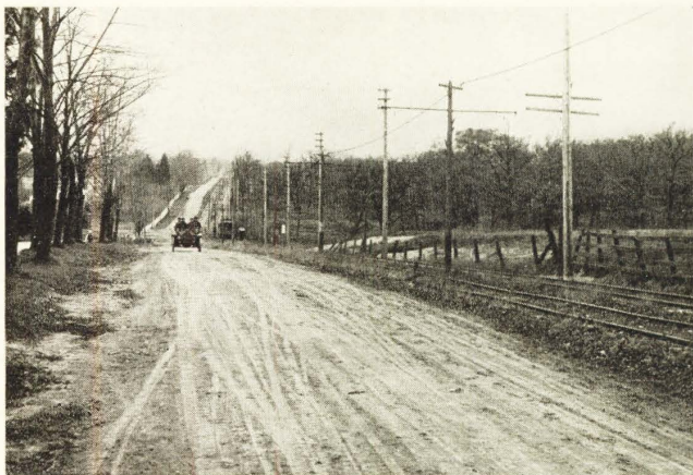
There were hills to climb, and the car carried a full load on nearly every trip

The average division on a railroad is less than 200 miles. The best of passenger locomotives are not as a rule run farther than one division at a time—one haul a day. They require careful inspection after each trip and a thorough overhauling every few months. A locomotive runs on smooth steel rails that are laid as evenly and firmly as men can lay them. The performance of a Chalmers-Detroit "30" motor on a common highway seems all the more wonderful in the light of such a comparison.