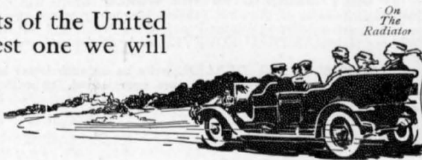
On The Radiator

Licensed under Selden Patent DETROIT, MICH., U. S. A.